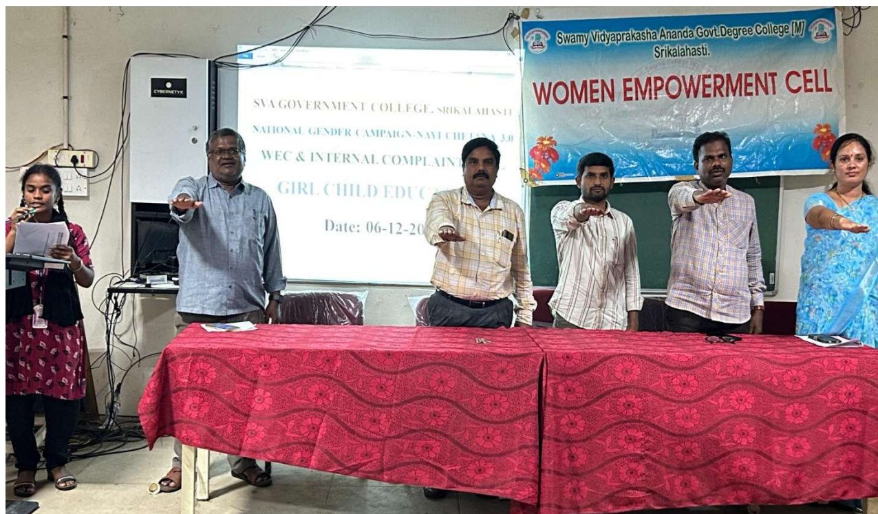
Teaching, Non-teaching staff and students attended to this program

A pledge against child marriages was taken during this program.