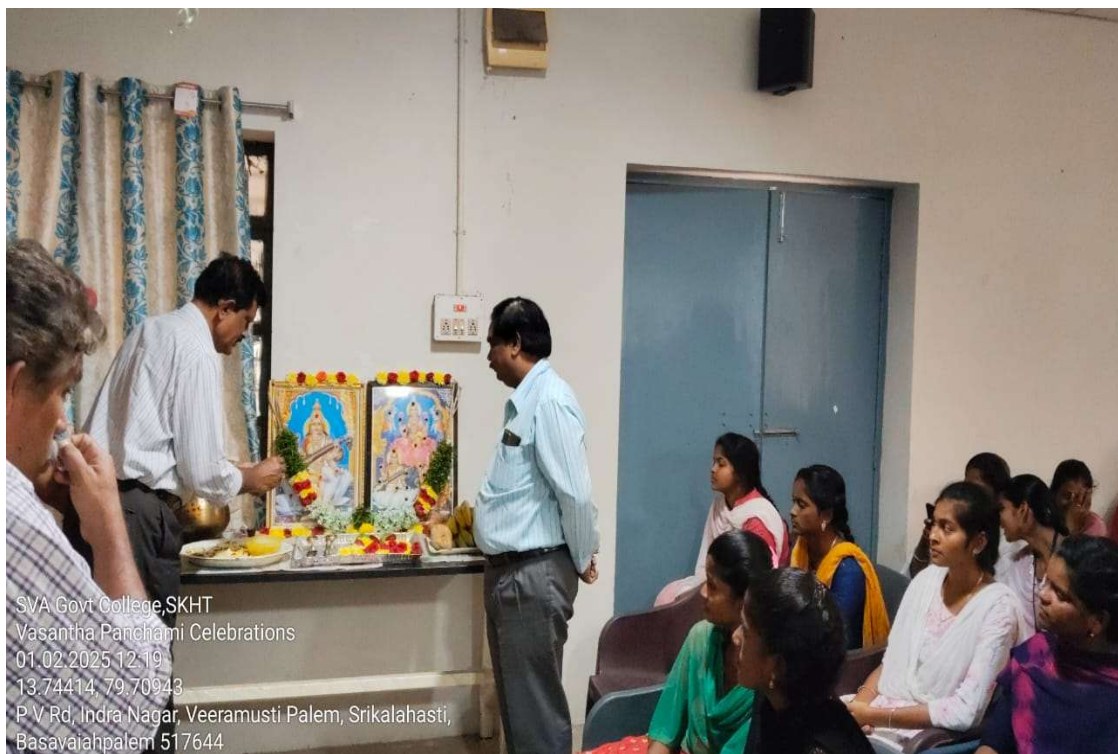
SVA Govt College,SKHT Vasantha Panchami Celebrations 01.02.2025 12:19 13.74414, 79.70943 P.V Rd, Indra Nagar, Veeramusti Palem, Srikalahasti, Basavajahpalem 517644