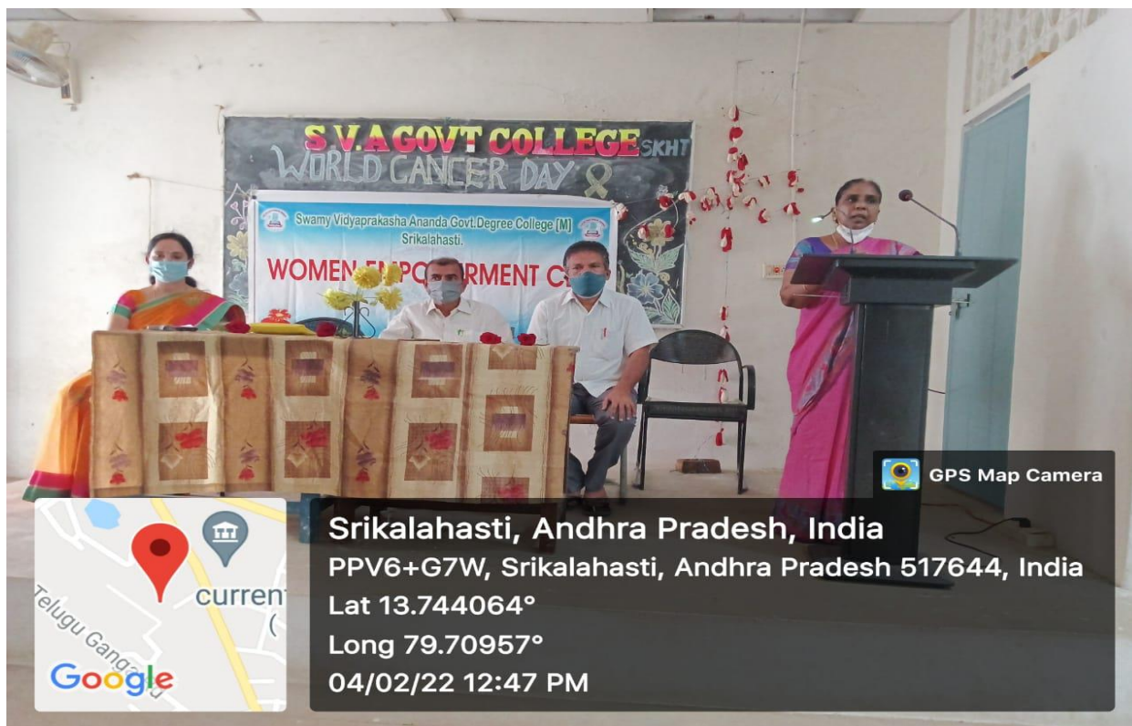
Teaching and Non-teaching staff and Girl students participated in cancer awareness program